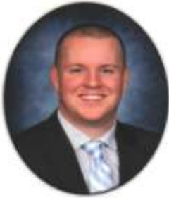
Kiley Waldrop Minister of Youth and Music